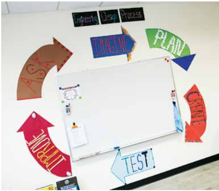
Photos from various interdisciplinary explorations in the Makerspace, including: pressing olive oil at Hanuka, solving physics problems, and a unit with a guest scientist from High Tech High Touch.